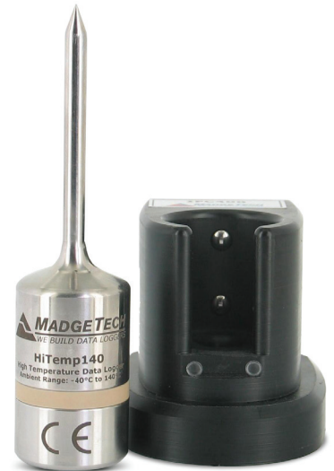
IFC400 (sold separately)

The HiTemp140 can store up to 32,700 readings, and features a rigid external probe capable of measuring extended temperatures, up to 260 °C (500 °F). Custom probe lengths are available up to 7 inches. The device records date and time stamped readings, and has non-volatile solid state memory which retains data even if the battery becomes discharged.