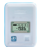
Freezer Standard version