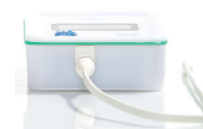
External temperature probe