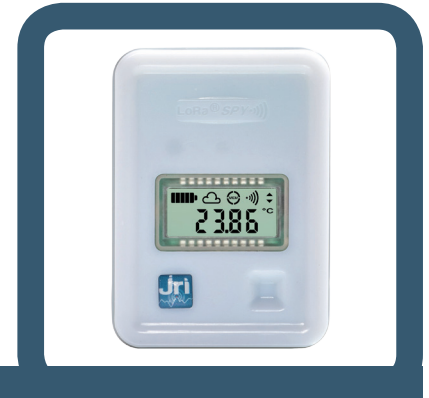
Non contractual photo

Temperature and door-opening recorder with a long-range LoRaWAN™ connectivity