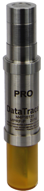
MPRF Pressure Data Logger